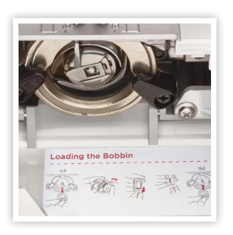
BOBBIN INSERTION GUIDE