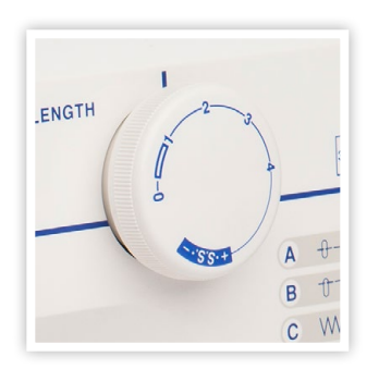
ADJUSTABLE STITCH LENGTH DIAL